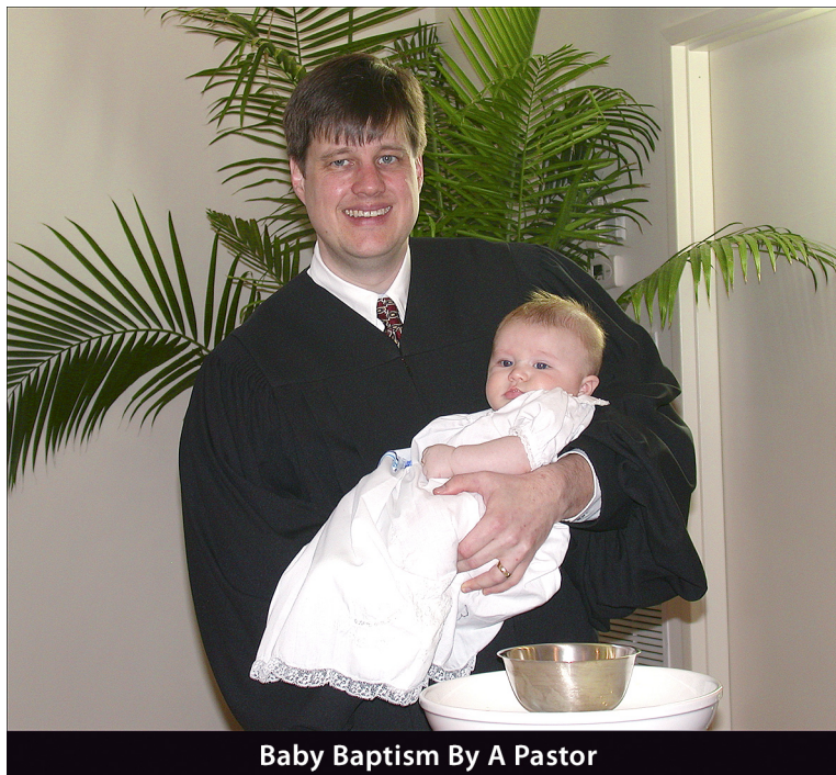
Baby Baptism By A Pastor

The initial search for such a pastor begins by asking friends, contacting seminaries, leaders within the denomination, or maybe a man who is currently serving as a pastor. Men are contacted, seminaries post potential vacancies on bulletin boards, and resumes are submitted. The Call Committee sorts through the resumes, interviews the men, or maybe visits the church that the potential