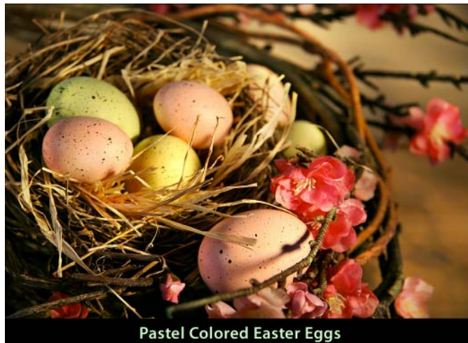
Pastel Colored Easter Eggs

Some are quick to say that the Roman Catholic Church invented the Easter eggs and bunnies. One person has asked, "Have you ever wondered where the celebration of the Christian holiday commemorating the resurrection of Christ acquired its unusual name and odd symbols of colored eggs and rabbits?" She offered the answer, "The answer lies in the ingenious way that the Christian church absorbed pagan practices. After discovering that people were more reluctant to give up their holidays and festivals than their gods, they