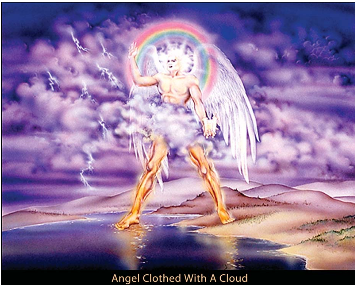
Angel Clothed With A Cloud