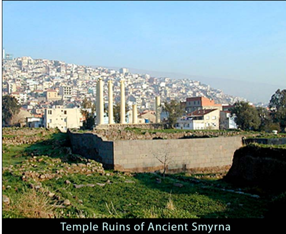
Temple Ruins of Ancient Smyrna

we discover that Christians lost their homes and possessions.