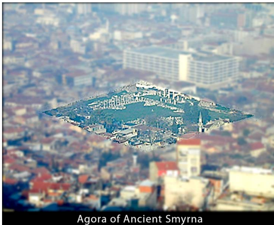
Agora of Ancient Smyrna

The city was not kind to the Christians, especially the Jews. It was there that many Christians died because they believed Jesus Christ was God. One of the best known