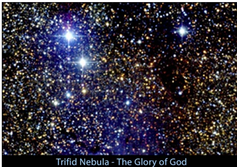
Trifid Nebula - The Glory of God

As for the mystery of the seven stars which you saw in My right hand, and the seven golden lampstands: the seven stars are the angels of the seven churches, and the seven lampstands are the seven churches. (NASB) Rev. 1:20