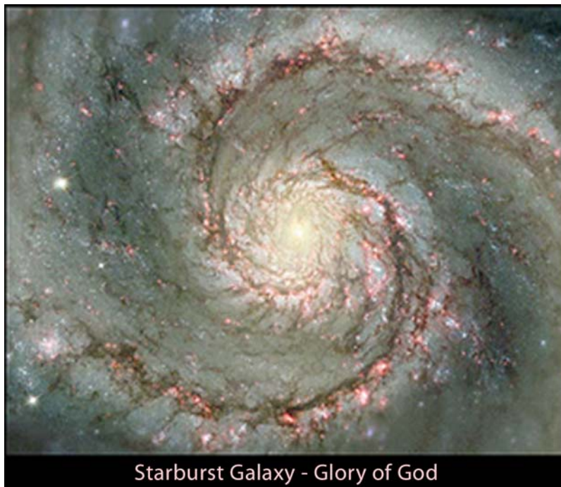
Starburst Galaxy - Glory of God