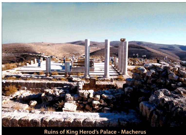
Ruins of King Herod's Palace - Macherus

John believed in Jesus and believed that they were on a divine mission.