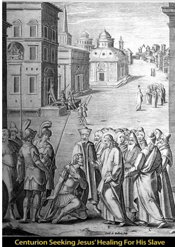
Centurion Seeking Jesus' Healing For His Slave

When they came to Jesus, they earnestly implored Him, saying, "He is worthy for You to grant this to him; for he loves our nation and it