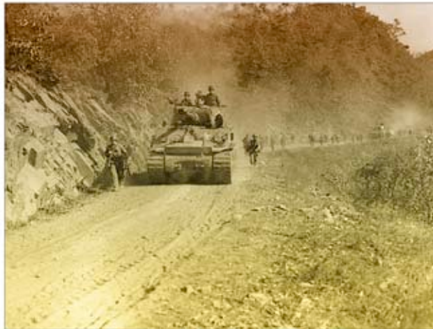
Armies Defend Nations Against Enemies

We saw in our last study that Jesus was not encouraging us to yield to unreasonable demands (please see the last study for details), but He was asking us to yield. He was also encouraging us to not seek revenge. Luke repeats this portion of Jesus' teaching and indicates that He spoke these words in between His command to love and pray for our enemies and the Golden Rule.