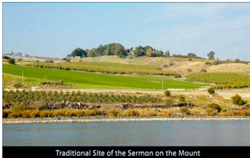
Traditional Site of the Sermon on the Mount

translate from the Greek to the English language. Some words are very difficult to translate from one language into another, and PRAUS is one of these words. So what does PRAUS mean? The answer to this question will unlock the meaning