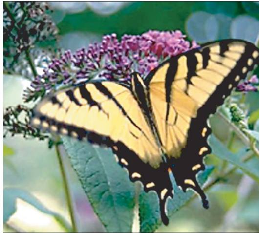
Marks of Maturity

Jesus Christ is the same yesterday and today, yes and forever. (NASB) Heb. 13:8