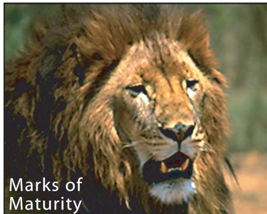
Marks of Maturity

Unless the LORD builds the house, They labor in vain who build it; Unless the LORD guards the city, The watchman