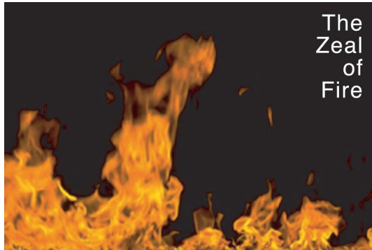
The Zeal of Fire

. . . but a certain terrifying expectation of judgment, and THE FURY OF A FIRE WHICH WILL CONSUME THE ADVERSARIES. Anyone who has set aside the Law of Moses dies without mercy on the testimony of two or three witnesses. How much severer punishment do you think he will deserve who has trampled under foot the Son of God, and has regarded as unclean the blood of the covenant by which he was sanctified, and has insulted the Spirit of grace? For we know Him who said, “VENGEANCE IS MINE, I WILL REPAY.” And again, “THE LORD WILL JUDGE HIS PEOPLE.” It is a terrifying thing to fall into the hands of the living God. (NASB) Heb. 10:28-31